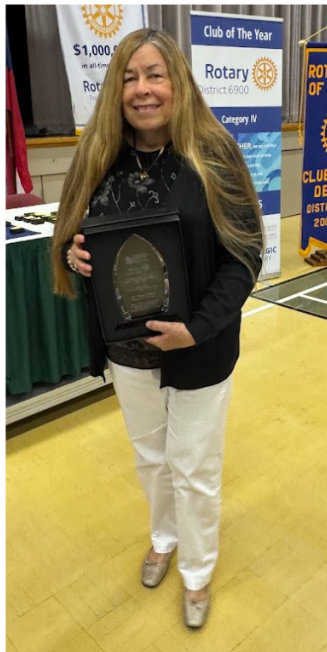
Frank E. Bentley District 6900 GRSP Leadership Award