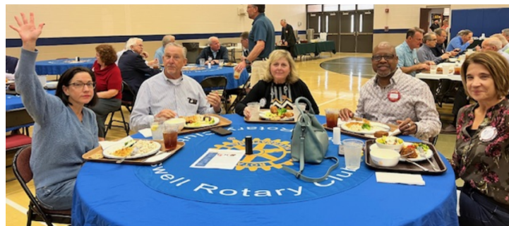
We all dance in our own ways!