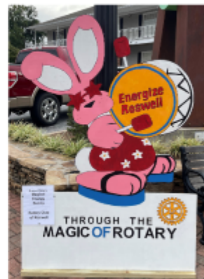
After Hours Club Roswell Rotary Club