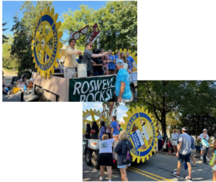
Roswell Rotary Scarecrows on Canton Street